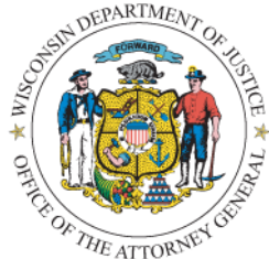
Office of Crime Victim Services