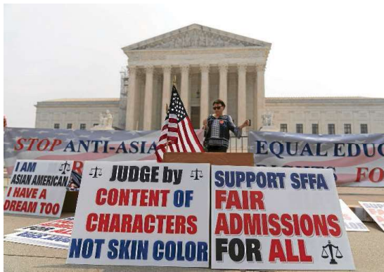
A person protests Thursday outside of the Supreme Court in Washington.