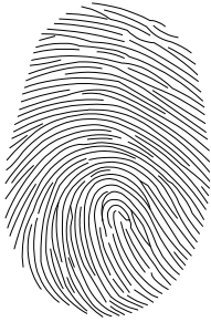
A fingerprint must accompany your request.

All identification in the criminal history repository is based on fingerprint comparison. The fingerprint on the form you submit will be compared to the arrest fingerprints on file to make sure the information is removed from the proper record.