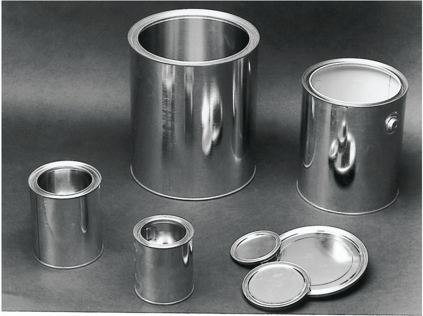
Fig. 31-1 New, clean, unlined paint cans make ideal containers for preserving evidence suspected of containing accelerants. Cans are available from paint stores or wholesalers.