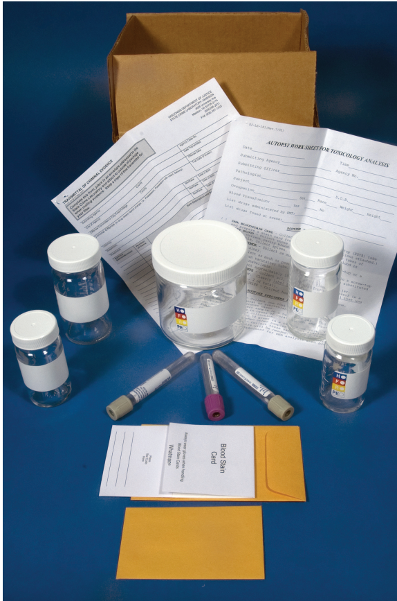
Fig. 25-3 Many of the samples required for toxicological analysis can be collected using an Autopsy Kit available from the State Crime Laboratory in Madison. Specimens for sexual assault analysis should also be collected; especially in any homicide involving a female victim—even if sexual assault is not immediately suspected. A Sexual Assault Evidence Collection Kit is available for this purpose, also available through the Department of Administration, Document Sales as noted at the front of this booklet. There is a nominal charge for both kits. Additional information on sexual offenses can be found in Chapter 6.