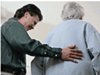
Obtain national background checks on nursing applicants

The law also requires that the request be submitted through the appropriate State agency, which in Wisconsin is the Crime Information Bureau. The Crime Information Bureau will first conduct a search of state criminal history files, and then forward the request to the FBI. The FBI will respond to the Crime Information Bureau, which will forward the FBI response to the nursing facility of home health care agency.